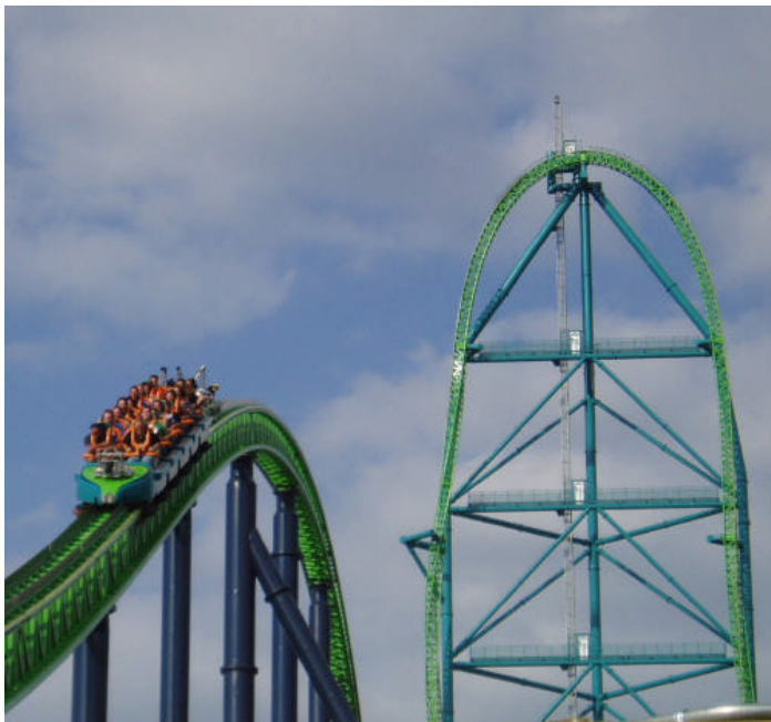
Kingda Ka

Six Flags Great Adventure has a new coaster that some of you may have heard of by now. Kingda Ka blasts off into the stratosphere at 128 MPH. It's the biggest and baddest, and about as close to heaven as you can get. Yeah, its opening was slightly delayed, and it's experiencing a few "break in" pains, but you've gotta ride it sometime this season. Visit the park's web site for updates and news.