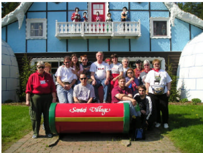
The Granite State Adventurers Take Over Santa's Village