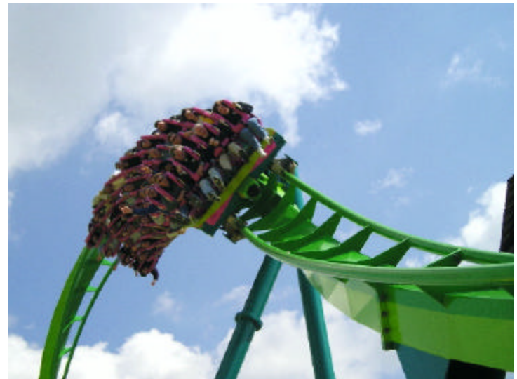
Hydra, The Revenge

A little jaunt into eastern Pennsylvania should satisfy your craving for inversions. Dorney Park's new coaster, Hydra the Revenge, is calling your name. Be sure to secure any loose change before riding, or be willing to sacrifice it to the JOJO ROLL!