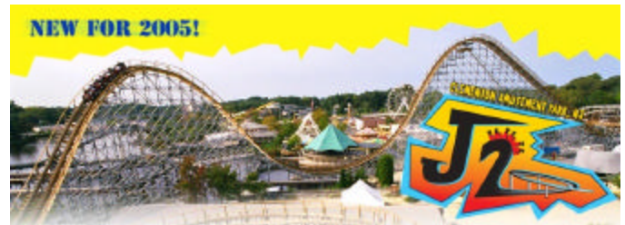
J2

With the late opening last year of Clementon Amusement Park's Tsunami, many of you may have missed your chance to ride it in 2004. Well, it's back this year with a new name and the same great thrills. J2 is waiting for all takers. (Pssst! All you folks who collect "rare" coaster memorabilia. Word's out that there are items with the old Tsunami logo for sale in the Clementon Amusement Park gift shop. Get 'em while they last!) And check out the SAVE THE DATE notice later in this newsletter.