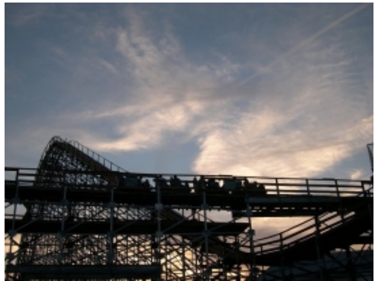
Riders return to the station during ERT at Clementon, September 2004 Tsunami's lift hill climbs to the heavens behind the brake run.