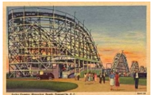
Humming Bird roller coaster, Riverview Beach Park, Pennsville, NJ