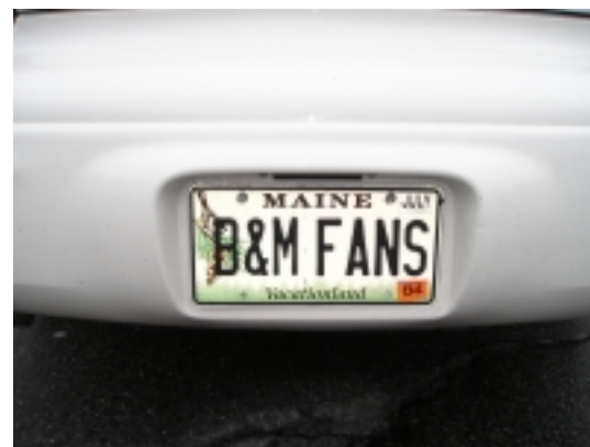
License Plate spotted at Eastcoaster.

The annual event at Morey's Piers is scheduled for Saturday, August 13, 2004. A flyer will be mailed and posted on the regional and national ACE web pages later this spring after we've worked out all the details.