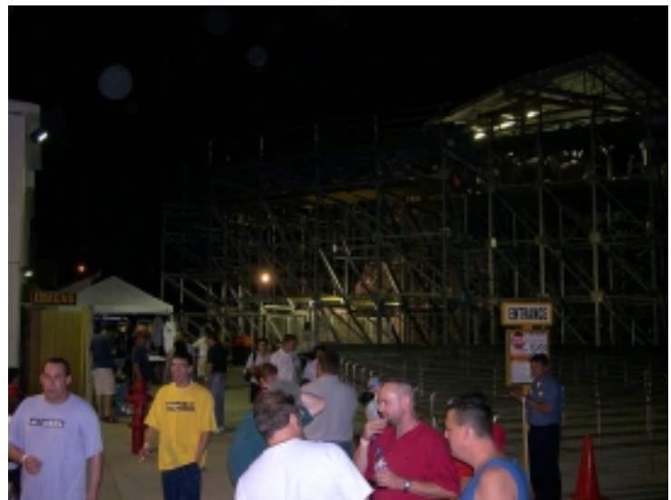
ERT at Clementon winds to a close. ACers buy souvenirs and snacks and talk about, what else? Coasters! Especially Tsunami!